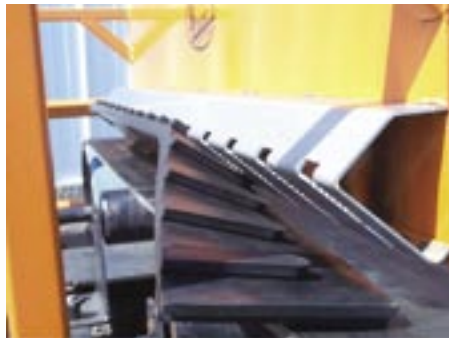
Easy peel-away removal