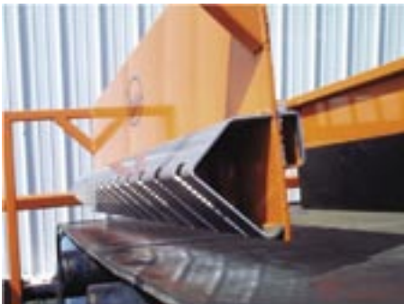
Stitch weld hanger to hopper (45° shown)

The EZ-SKIRT Skirting System was developed in the tough hard-rock mining conditions of the Minnesota Iron Range. Plant managers and maintenance personnel alike are finding that the EZ-SKIRT Skirting System provides the quickest return on investment for their conveyor system.